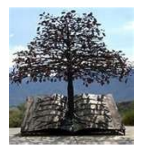
Sharing knowledge using adult participatory learning techniques

We can provide a basic awareness training for your workers with an OSHA 10 hour outreach; a program designed to benefit all workers. Your safety committees, safety audit teams, supervisors or others with more extensive safety and health responsibilities may be better served with an OSHA 30-hour outreach training program. Either of these programs can be provided in the General Industry or Construction format. Contact the center today for more details.